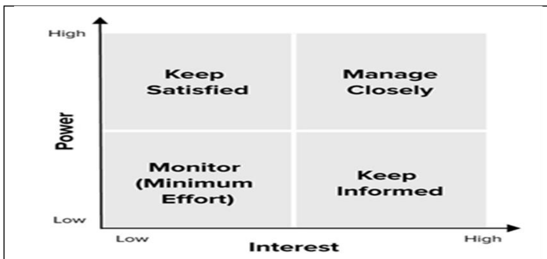
Figure 1: Power Grid

The position that BoN allocates to a stakeholder on the grid will indicate the actions needed to take on engagements with each stakeholder: