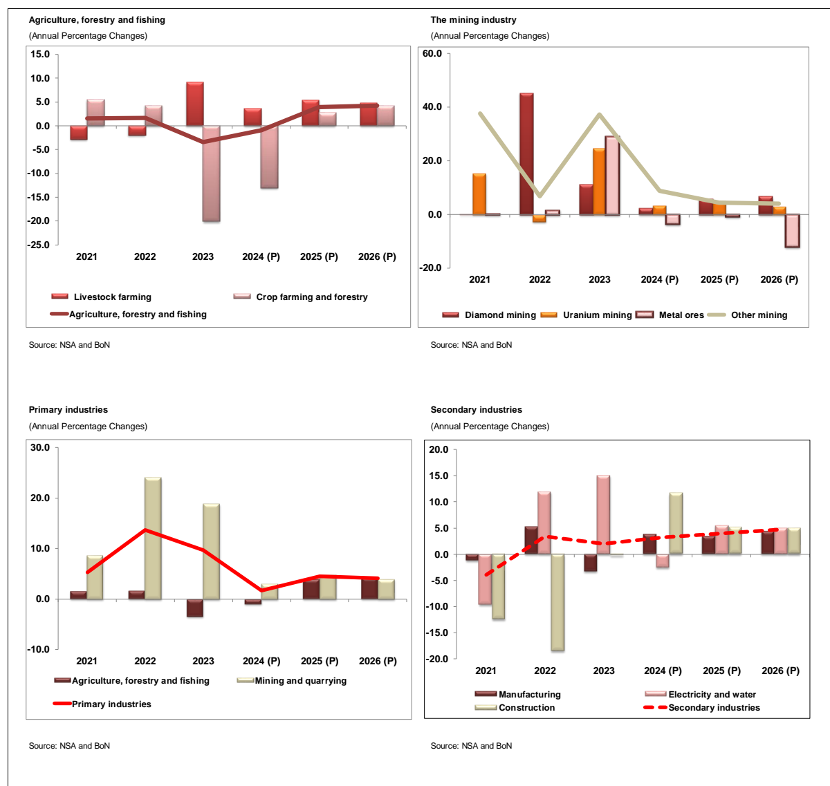
Figure 2: Growth in primary and secondary industries