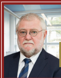
HONOURABLE CALLE SCHLETTWEIN

Minister of Agriculture, Water and Land Reform